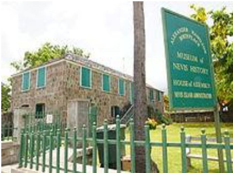
The Birthplace And Early Childhood Home Of Alexander Hamilton, In Nevis, West Indies .